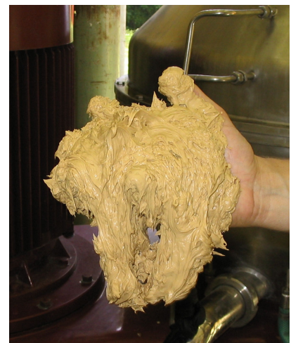
Maximum Yield + High Clarification - Delivered

Price / Performance that separates the STS 45 from the rest