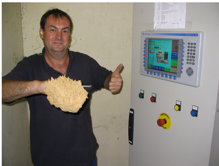
Operator Control System at Distell Group - Bergkelder, Stellenbosch, South Africa