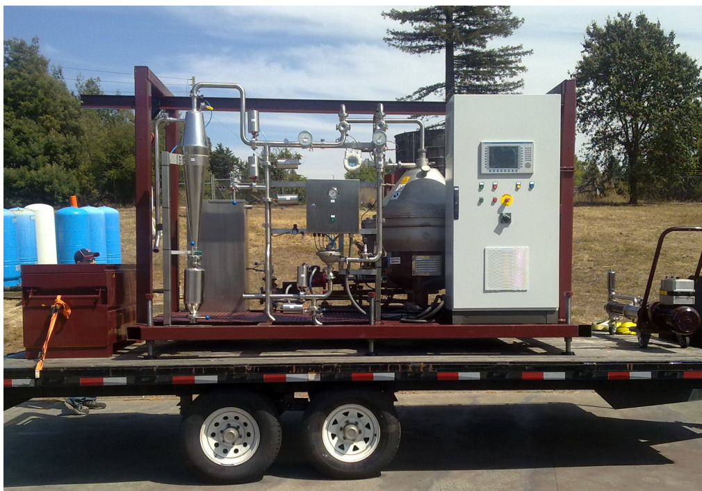
Skid-Mounted STS 45 for Mobile Service at American Winesecrets, Napa, California, USA

Actual capacities are subject to the specific characteristics of the product & installation.